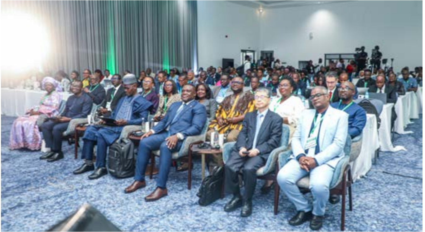
A cross-section of participants at the event

The Minister further noted that Africa secured twenty-nine (29) leadership positions across ITU structures, with experts from thirteen (13) countries serving as Chairs, Vice Chairs, and TSAG Vice Chairs, marking a significant milestone in the continent's participation in global standard-setting.