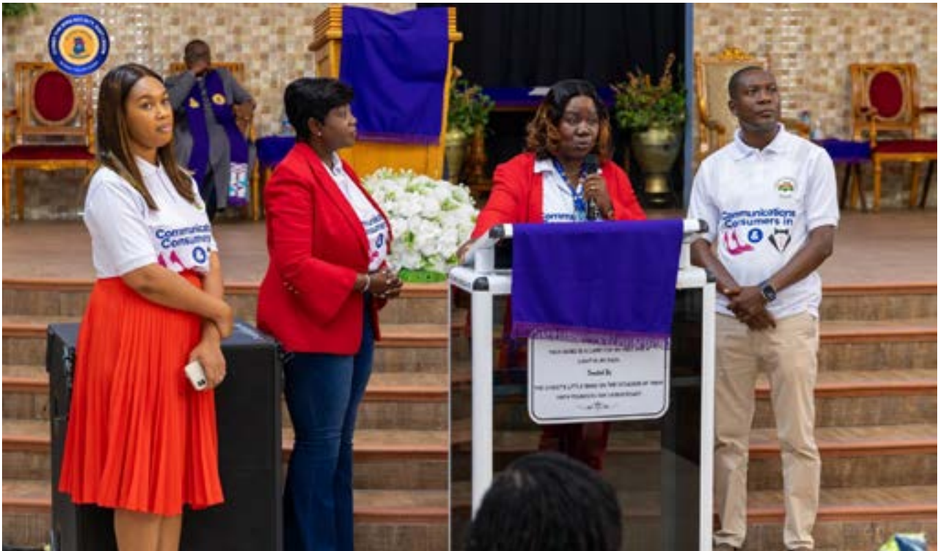
The outreach team engaged and educated consumers on their rights and responsibilities, promoting informed and responsible use of communications services

The National Communications Authority (NCA) commemorated World Consumer Rights Day (WCRD) 2026 by engaging congregations in selected churches across the country, emphasising the collective effort in protecting consumers and fostering a sense of shared purpose to safeguard telecommunications rights.