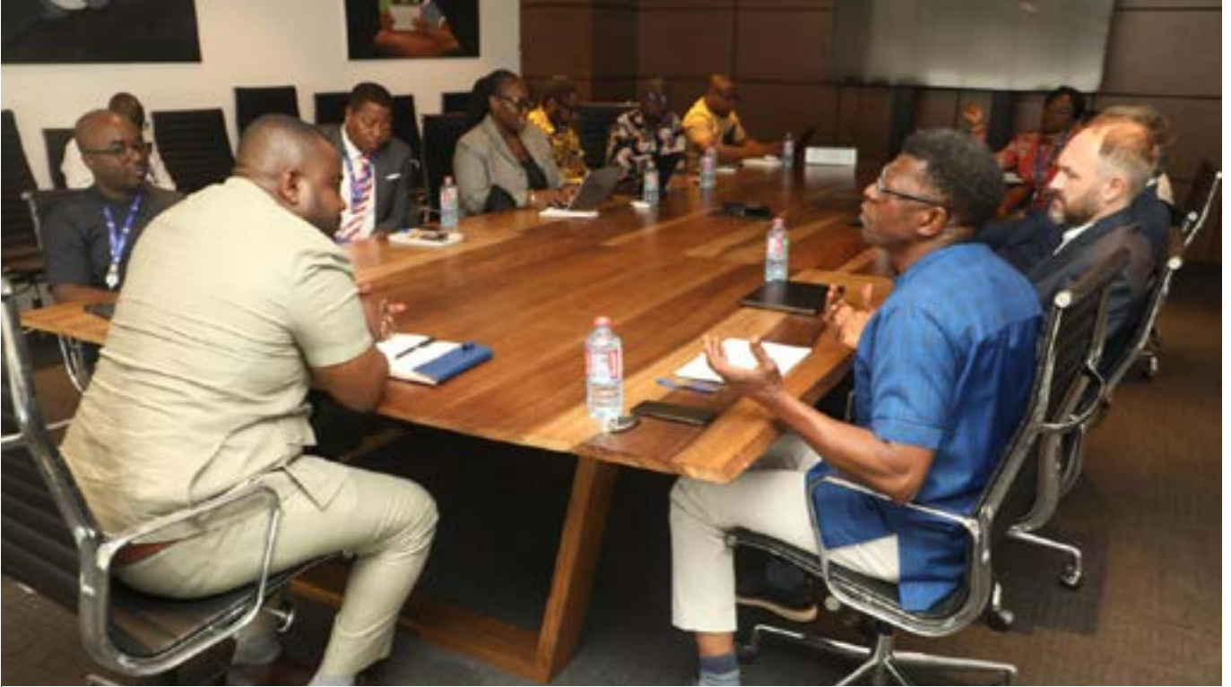
A group picture of the delegation with some Management Staff

meaningful engagement on the development of a robust competition regime in Ghana.