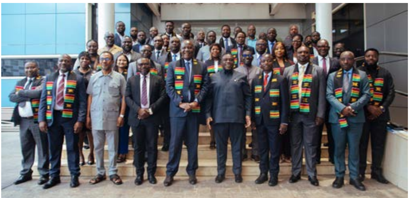
A group photograph of participants with the sector Ministers from Ghana and Zambia