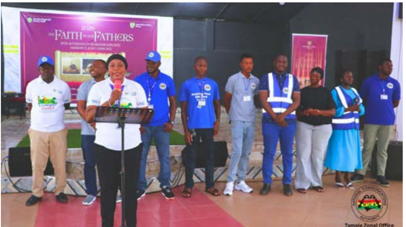
Consumer complaints were addressed during the outreach

The celebration, which also coincided with the Authority’s 30 th Anniversary celebration, highlighted its continued commitment to consumer protection and reflected its efforts at ensuring broader awareness and participation of consumers in its 30 th Anniversary celebrations.