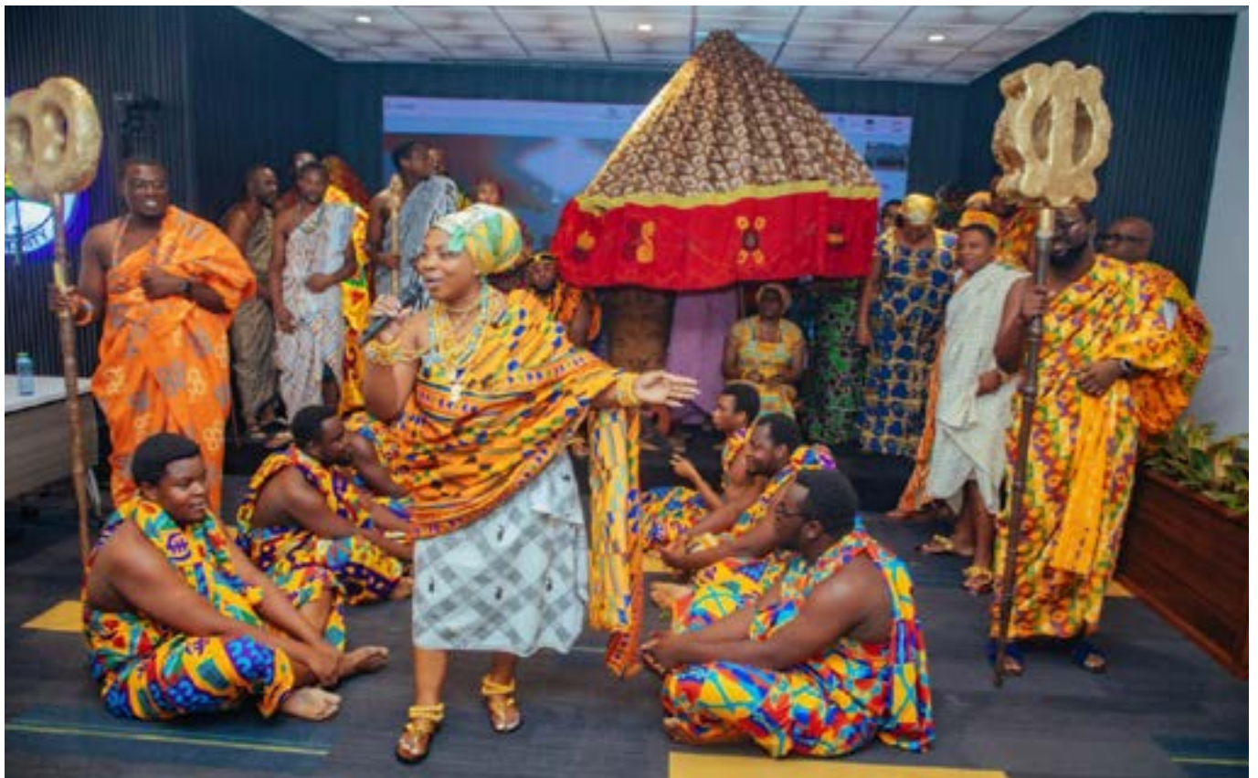
Coming in fourth place, Team Bono Region gave a spirited performance

commitment to promoting national identity and cohesion.