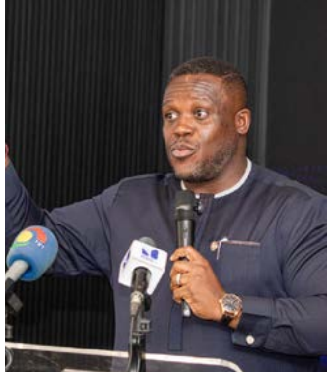
Minister for Communication, Digital Technology and Innovations, Samuel Nartey George, delivering some remarks