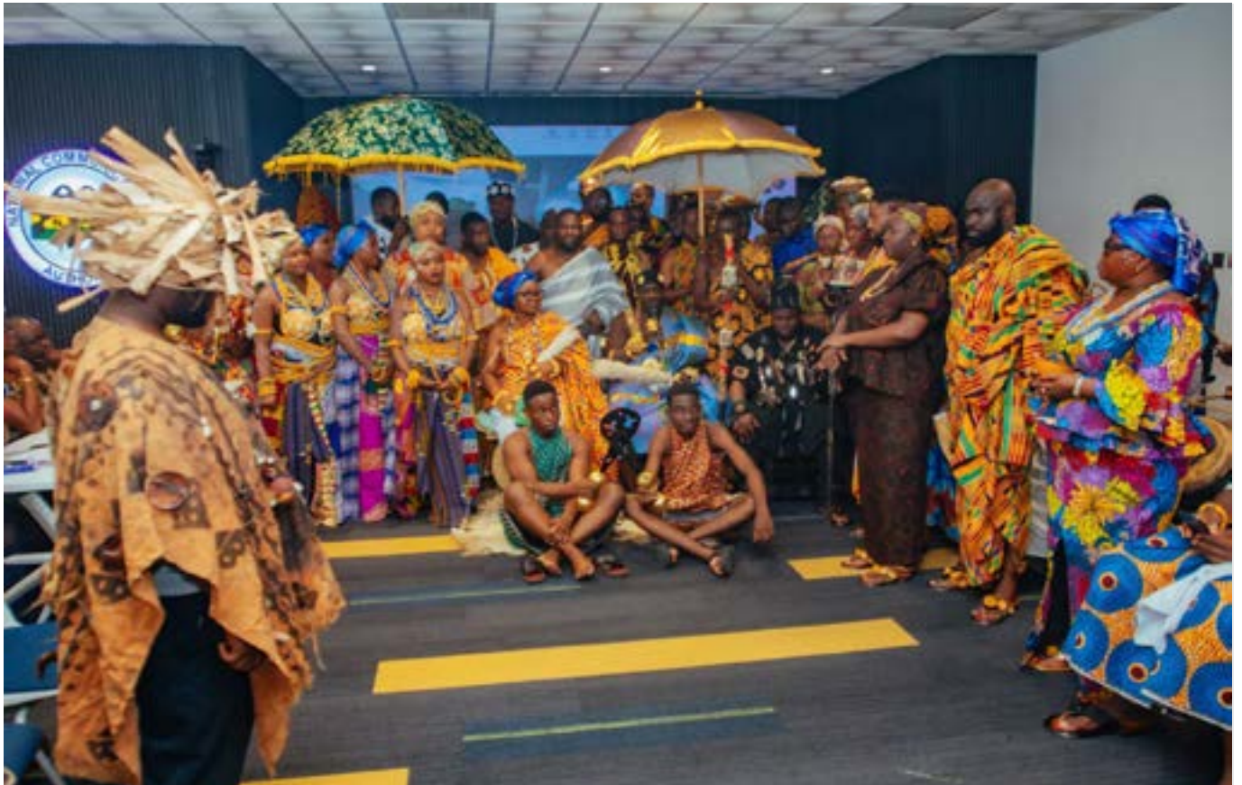
Securing third place, Team Eastern Region impressed with an energetic and engaging performance

commitment to promoting national identity and cohesion.