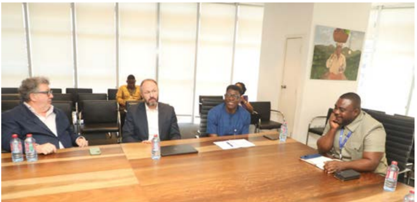
The delegation during the courtesy call at the NCA Tower

The courtesy call follows a successful one-day seminar on Ghana's competition law and policy which was held in Accra on 25 th March, 2026, in which the NCA actively participated. The seminar focused on competition economics, policy and law, and provided a platform for