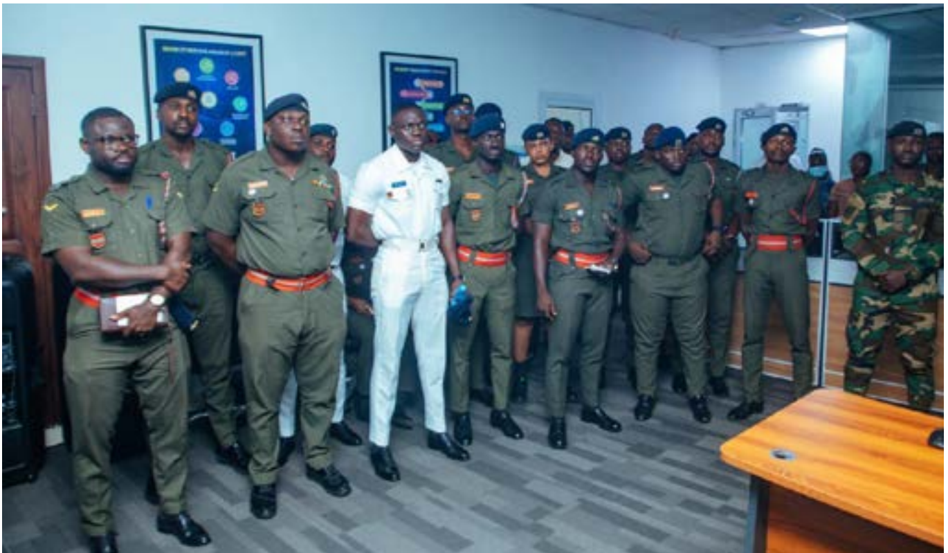
Some of the soldiers on a tour of the NCA-CERT

The visit, which aligns with their curriculum, was aimed at reinforcing the professional development of the soldiers and exposing them to the practical application of Information Technology (IT). It also provided an opportunity for the students to appreciate the interface between Information Technology, Cybersecurity,