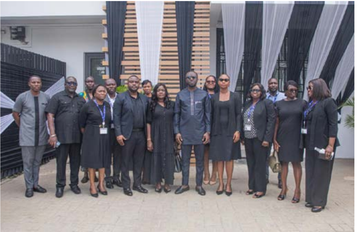
A group picture of the NCA delegation with the family