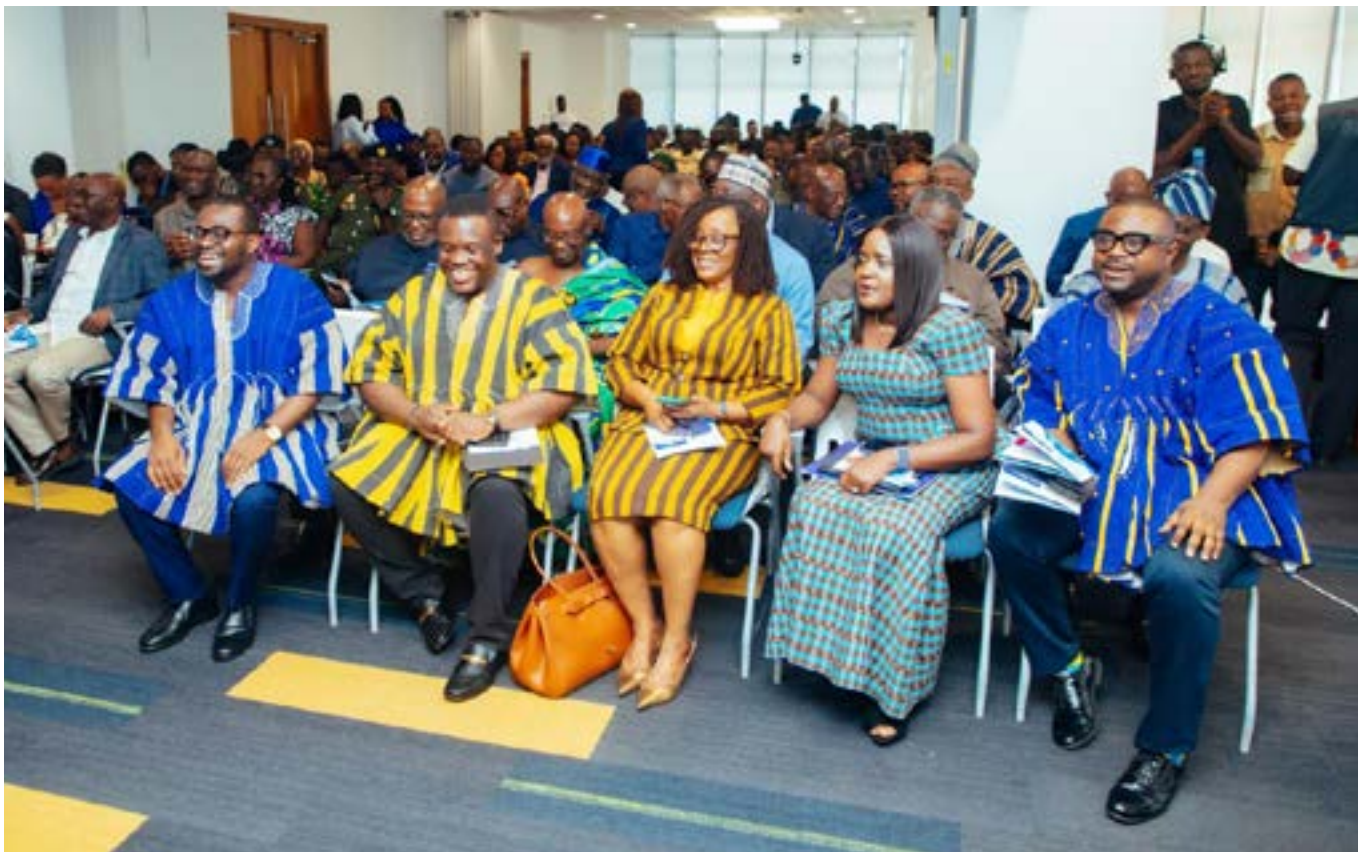
Industry leaders and stakeholders gathered at the NCA Tower to mark 30 years of communications regulation in Ghana

Chairperson of the National Communications Authority at the launch of its 30 th Anniversary celebrations. For me, this moment truly feels like coming full circle. Many years ago, I had the privilege of contributing to Ghana's telecommunications reform programme, which laid the foundation for sector liberalisation," she said.