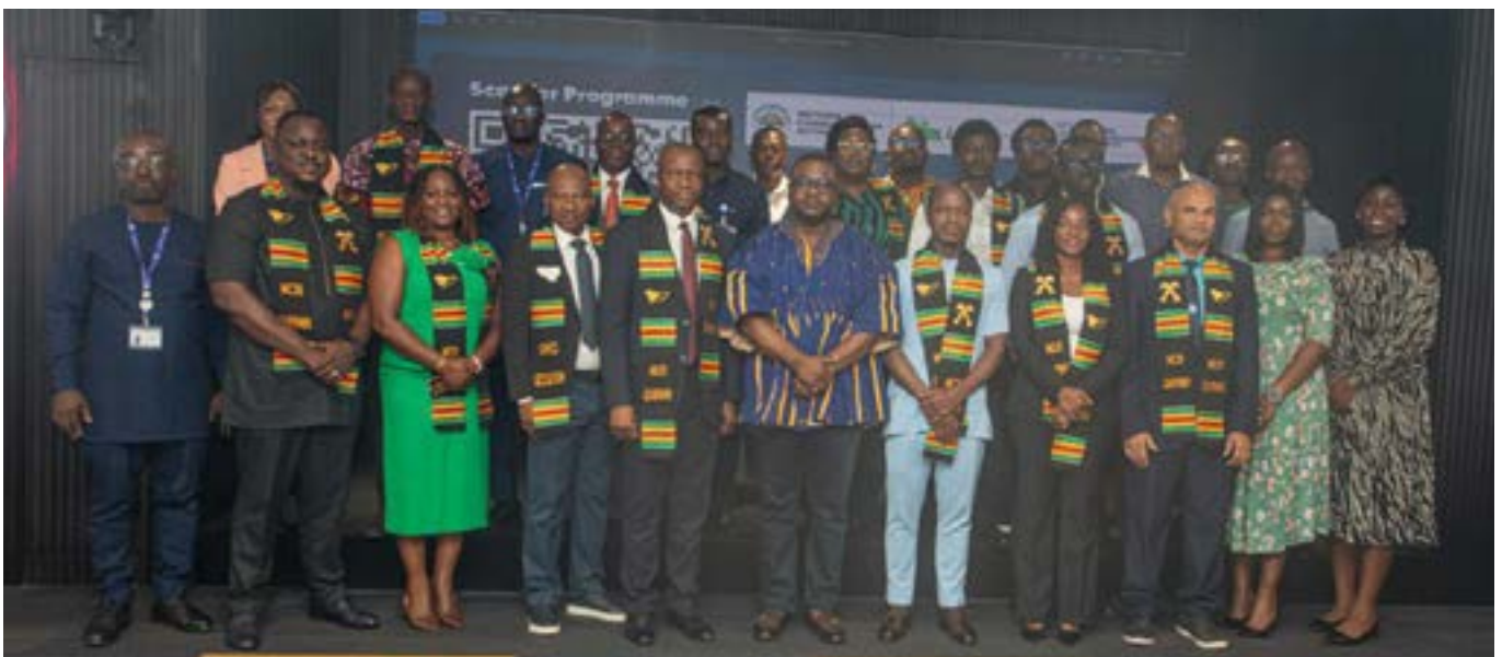
A group picture of participants at the meeting

The high-level engagement was focused on deepening collaboration, aligning implementation strategies, and addressing technical and operational considerations required to operationalise seamless roaming services across the three countries. It was expected to culminate in the signing of MoUs on the final day of the meeting, marking a significant milestone towards reducing roaming costs and enhancing cross-border connectivity.