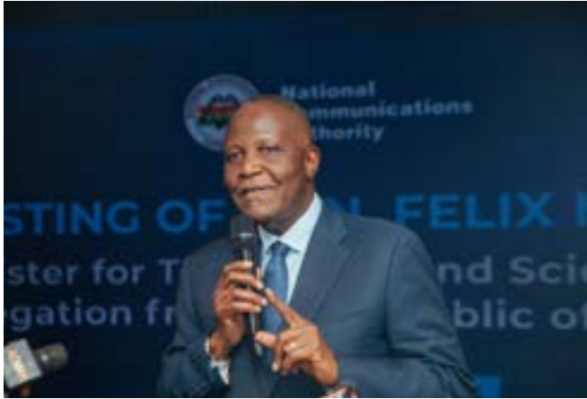
Hon. Felix Mutati, Minister of Technology and Science, delivering his remarks