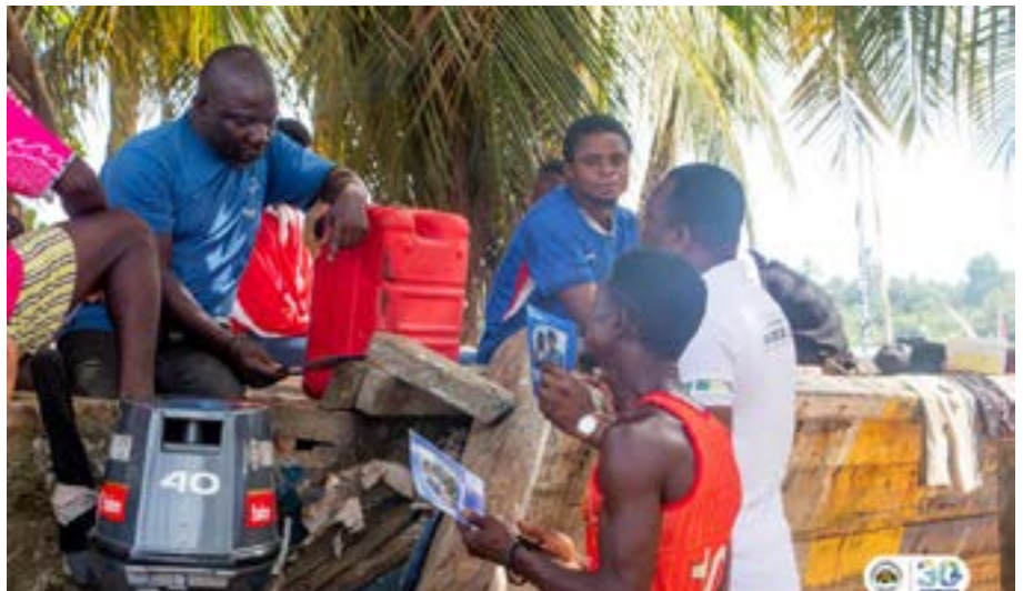
No one was left out of the educational drive

The exercise, while providing a platform for consumers to also share their concerns, ultimately reinforced the importance of continuous, community-based engagement in promoting informed and protected telecommunications consumers.