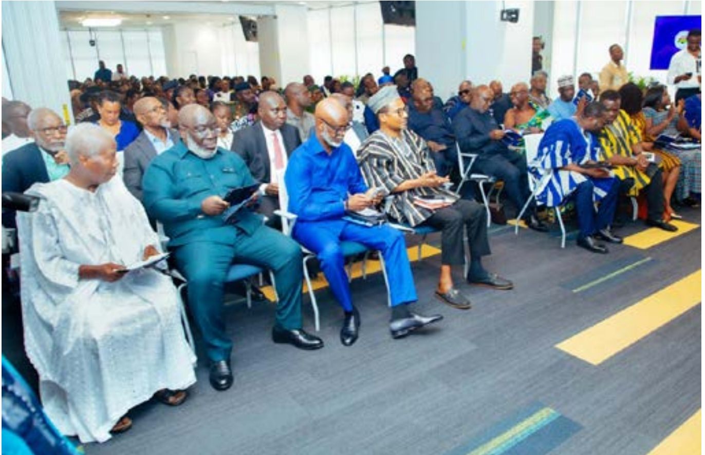
Past Board Chairs, former Directors General and industry stakeholders in attendance at the NCA's 30th Anniversary launch

"I joined this Authority in December 2004 as a National Service person, fresh from university and eager to contribute. Since then, I have had the privilege of serving continuously within the NCA – learning, growing, and working alongside dedicated professionals who believe deeply in the mission of this institution," he said.