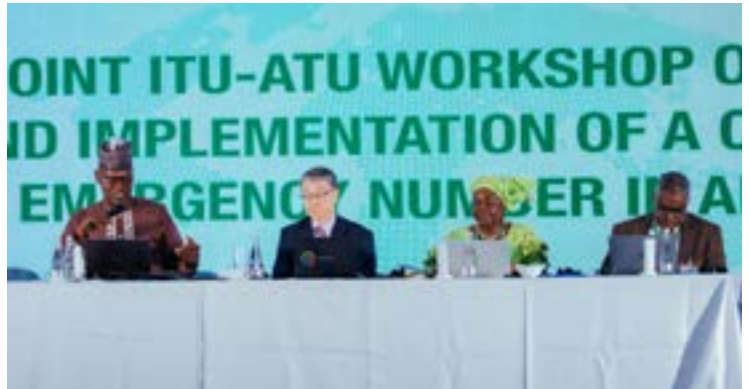
Joint ITU-ATU Workshop

The First African Preparatory Meeting (APM-1) is a regional coordination forum where African countries begin discussions and develop common positions ahead of the World Telecommunication Standardization Assembly 2028 (WTSA-28). It enables regulators, policymakers, and technical experts to align priorities, share perspectives, and strengthen Africa's collective voice in global telecommunications standardisation processes.