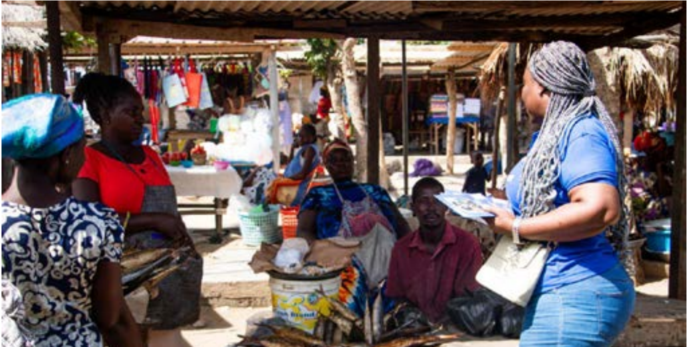
The outreach team educating consumers in the market

The National Communications Authority (NCA) conducted an outreach programme in selected communities within the Ada area of the Greater Accra Region on 22 nd April, 2026. The exercise formed part of efforts to bridge the consumer information gap in rural areas and empower citizens with knowledge on telecommunications services and consumer protection.