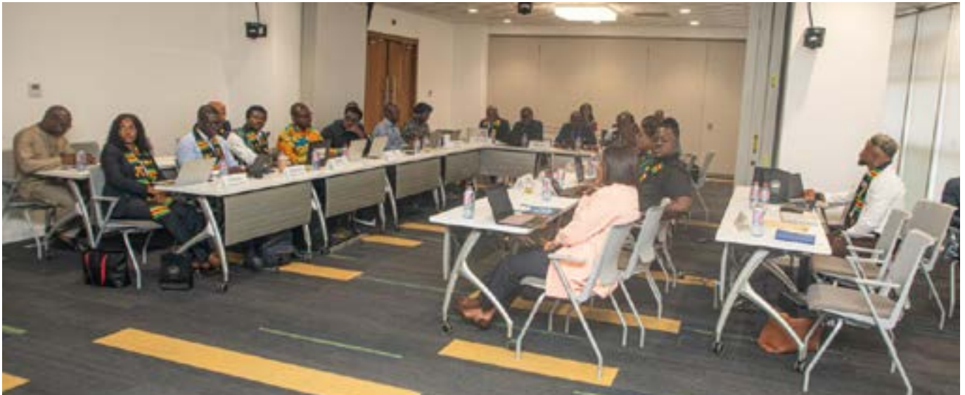
Delegates in session at the Tripartite ECOWAS Roaming Meeting at the NCA Tower

inclusive development, stressing that regional integration had to be supported by harmonised digital systems and regulatory frameworks.