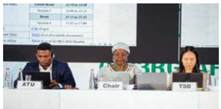
Study Group 2 focused on the operational aspects of telecom networks

These are technical meetings of regional groups under the ITU Telecommunication Standardization Sector (ITU-T), where African experts contribute to the development of international telecommunications standards. Study Group 2 focuses on operational aspects of telecom networks, including numbering and service provision, while Study Group 3 addresses economic and policy issues such as tariffs, costing, and interconnection, ensuring Africa's input is reflected in global standard-setting.