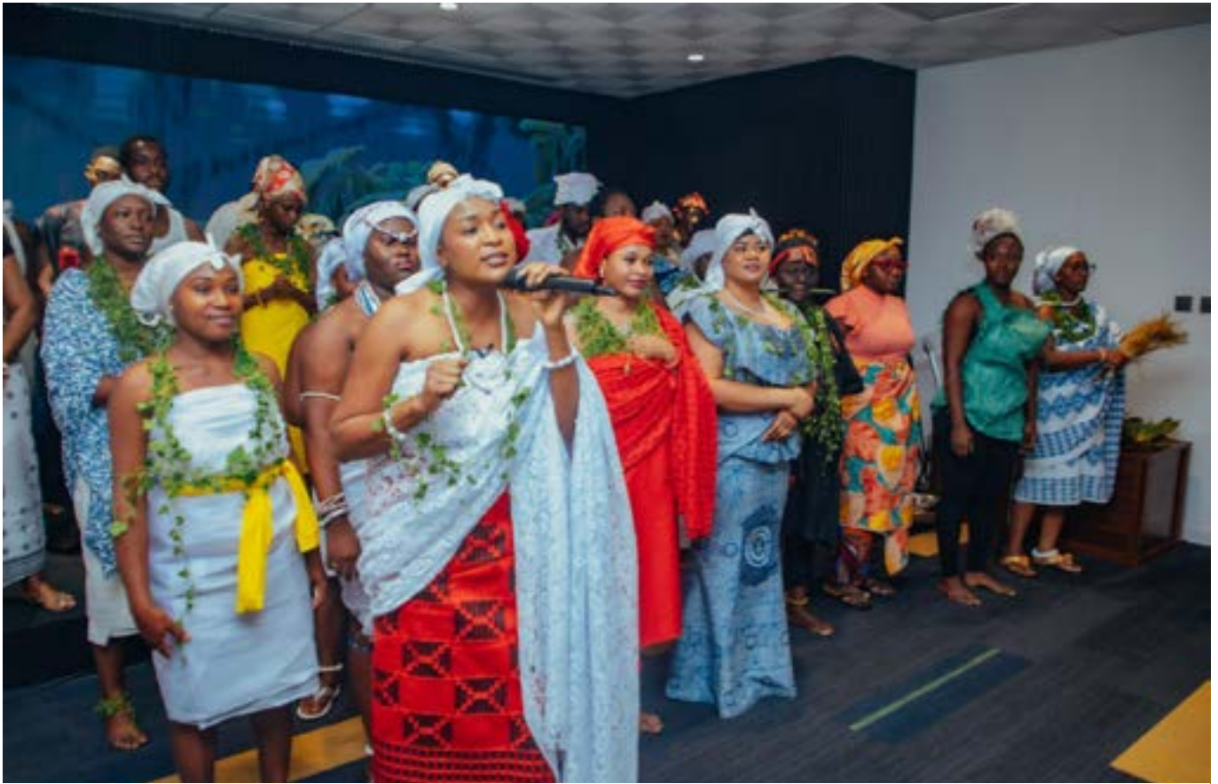
Members of Team Greater Accra Region, the winners of the day, delivering an outstanding performance

Bringing its Heritage Month activities to a vibrant climax on 30 th March, 2026, the National Communications Authority (NCA) proudly showcased the rich and diverse cultural heritage of Ghana through an engaging and colourful celebration.