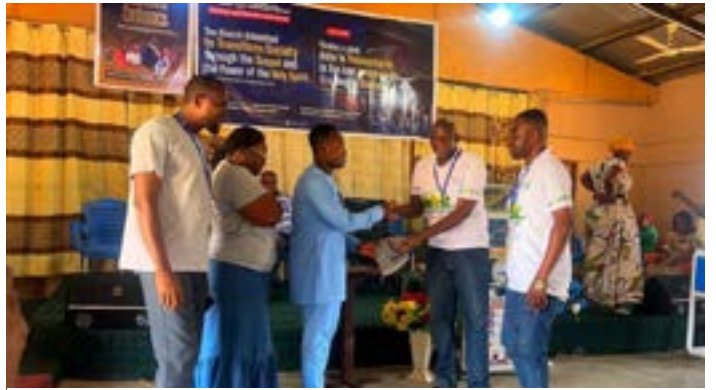
Consumers were given souvenirs as part of the engagement

operates offices. Churches engaged in the regions included Sumbrungu Church of Pentecost, Bolgatanga; Prophetic Ark Chapel, Liberty Junction, Koforidua; St. Theodore Catholic Church, Barracks, Sunyani; Christ the King Methodist Church, Anaji, Takoradi; Assemblies of God Church, Yendi, Tamale; Mount Olives Presbyterian Church, Kumasi; and the Salem E. P. Church, Klefe Kpodzi, Ho.