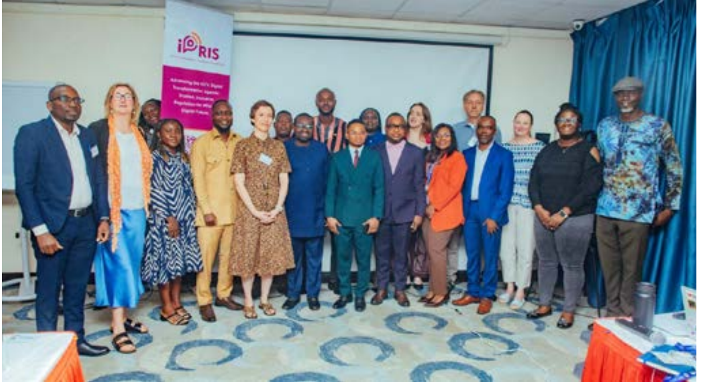
A group photograph of some Management and staff of the NCA, institutional representatives and participants

Southern Africa (CRASA), the East African Communications Organisation (EACO), and the West Africa Telecommunications Regulators Assembly (WATRA).