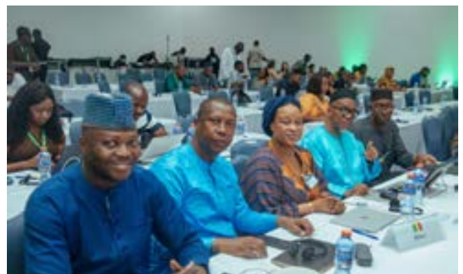
Delegation from Mali

The week-long engagement will feature the Joint ITU/ATU Workshop on the Economic Impact of Over-the-Top (OTT) services, discussions on the implementation of a Common Emergency Number in Africa, as well as meetings of the ITU-T Study Group 2 Regional Group for Africa (SG2RG-AFR) and the ITU-T Study Group 3 Regional Group for Africa (SG3RG-AFR), bringing together policymakers, regulators, industry leaders, and technical experts from across the continent.