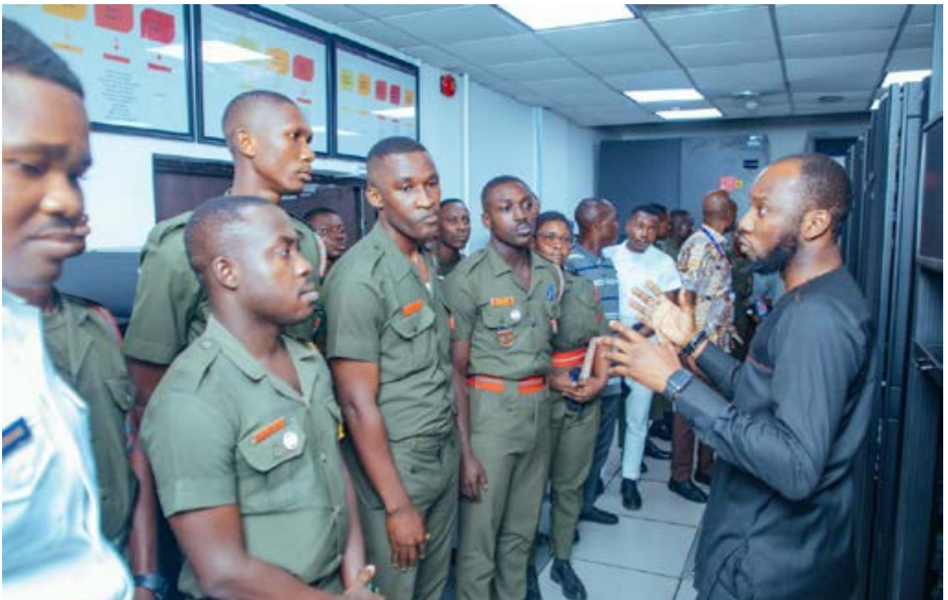
The participants on a guided tour at the NCA Tower

The students were also taken on guided tours of selected IT and cybersecurity installations within the Authority to gain first-hand insight into their technical operations.