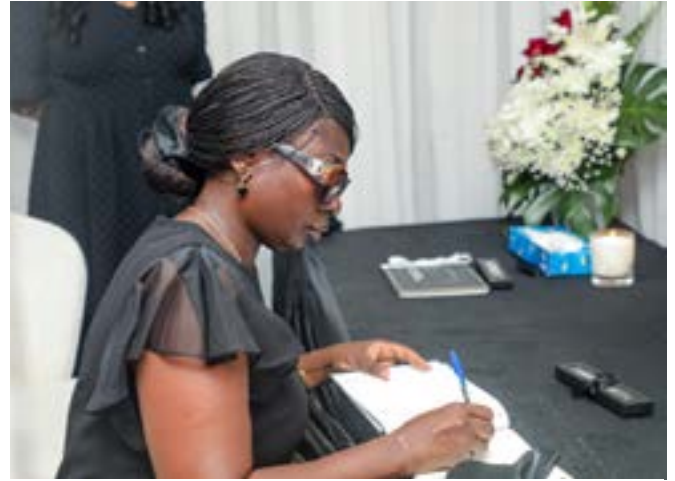
Some members of the delegation signing the book of condolences