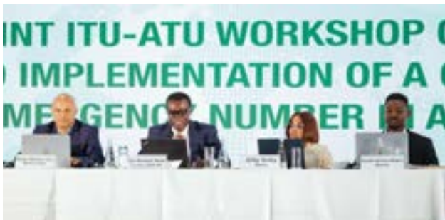
The meeting focused on key emerging issues in the communications sector

These workshops, jointly organised by the International Telecommunication Union (ITU) and the African Telecommunications Union (ATU), focus on key emerging issues in the communications sector. They address the regulation and impact of Over-the-Top (OTT) services (such as messaging and streaming platforms), as well as efforts to establish a unified emergency number across Africa to improve access to emergency services and enhance public safety.