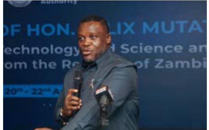
Hon. Samuel Nartey George, Minister of Communication, Digital Technology and Innovations (MoCDTI) welcoming the delegation