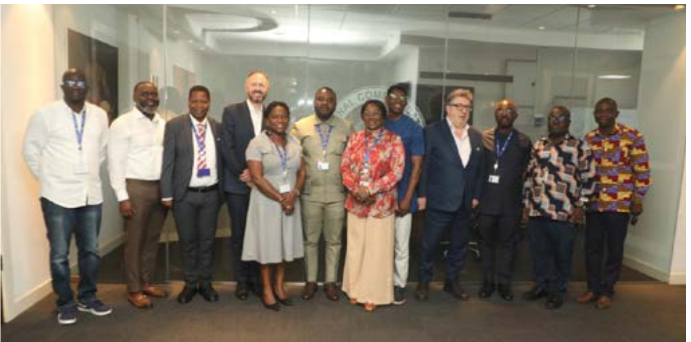
A group picture of the delegation with some Management Staff

The visit further provided an opportunity to strengthen collaboration and promote knowledge exchange between the NCA and leading global experts as Ghana continues to advance its regulatory and competition landscape.