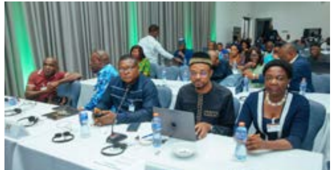
A cross-section of participants at the event

Key discussions included the Regional Workshop on Over-the-Top (OTT) Services during which stakeholders examined economic and regulatory frameworks, particularly the “fair share” debate, to promote sustainable investment