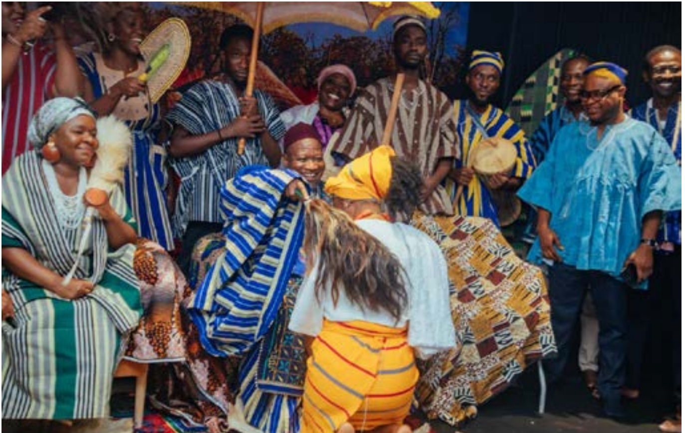
Taking second place, Team Northern Region delivered a strong and memorable performance

The Ashanti Region was represented by the Human Resource Division, Legal Affairs Division, and the Kumasi Zonal Office. Their display featured the elegance of Asante Kente and a graceful performance of the Adowa dance, leaving a lasting impression on the audience.