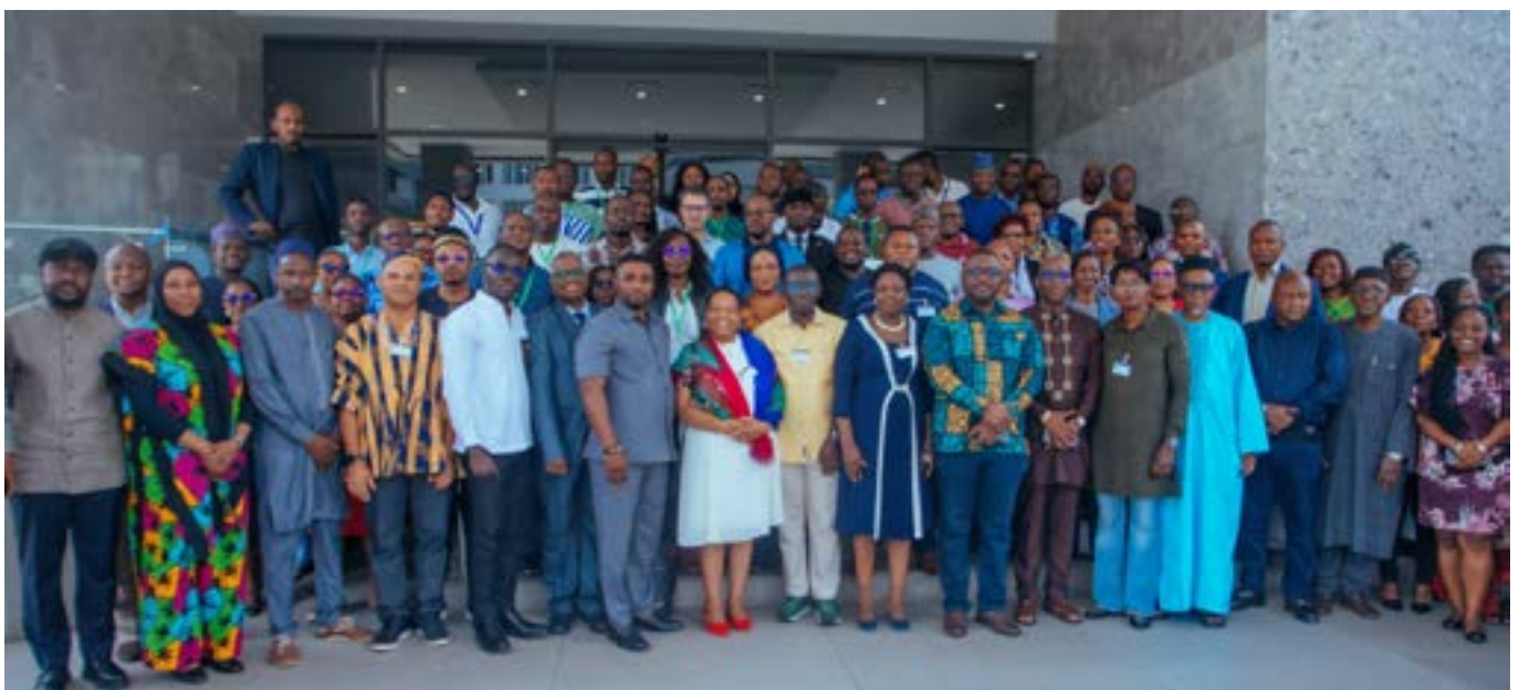
A group photograph of delegates from Member states and dignitaries at the event

The meeting further served as a platform for establishing governance structures and working groups for the WTSA-28 cycle; identifying priority technical areas such as Artificial Intelligence, cybersecurity and subsea cable resilience; and strengthening multi-stakeholder collaboration among industry, academia, and civil society. These efforts are geared towards ensuring that emerging ICT standards are inclusive, resilient,