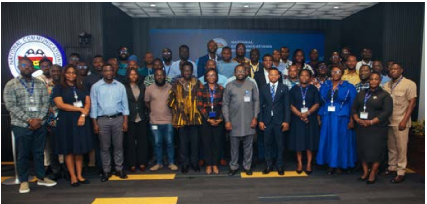
A group photo of NCA Staff with Participants

Held every three (3) to four (4) years, the World Radiocommunication Conference is organised by the Radiocommunication Bureau of the International Telecommunication Union (ITU-R). It serves as the principal global forum for reviewing and, where necessary, revising the Radio Regulations – the international treaty governing the use of the radio frequency spectrum – as well as geostationary and non-geostationary satellite orbits.