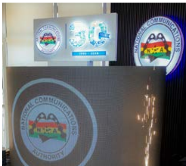
NCA @ 30 Anniversary logo unveiled