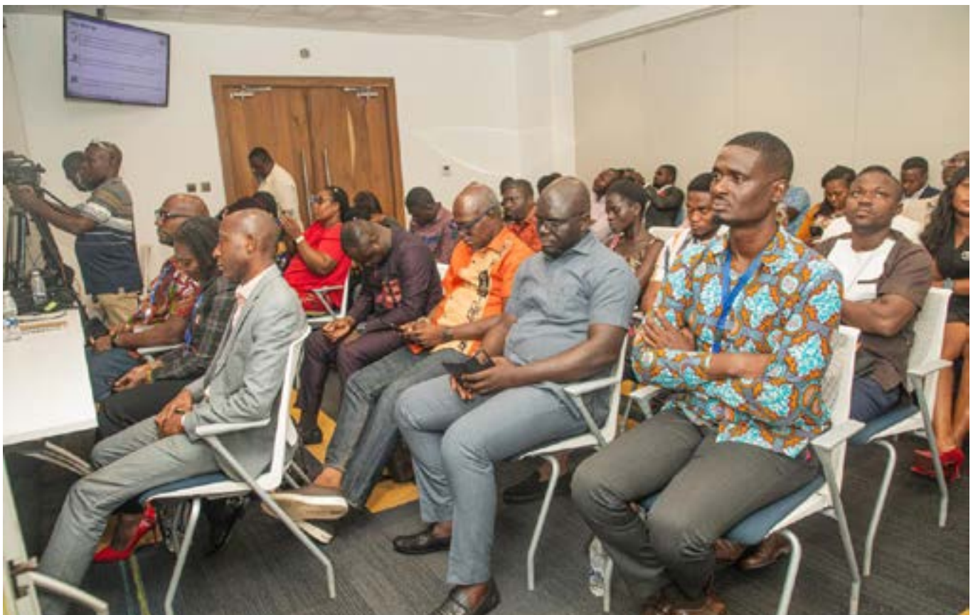
A photo of some representatives from the media at the interactive session