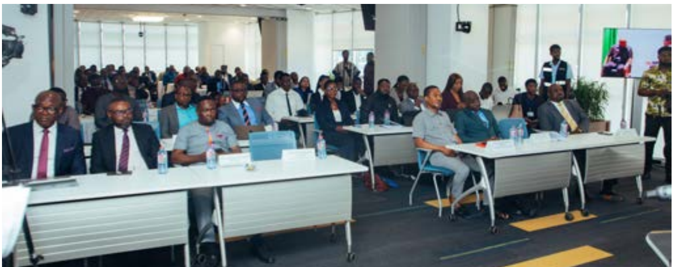
A cross-section of participants at the meeting

The engagement builds on earlier bilateral discussions held during the recent state visit of the President of the Republic of Ghana, His