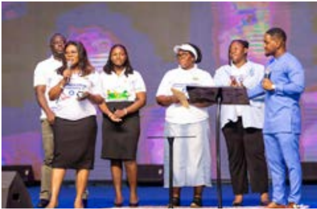
Staff of the NCA engaging consumers at church