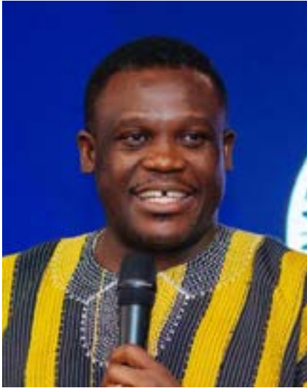
The Minister of Communication, Digital Technology and Innovations, Hon. Samuel Nartey George, delivers the keynote address outlining government's vision for an inclusive digital future