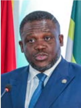
The Minister for Communication, Digital Technology and Innovations (MoCDTI), Hon. Samuel Nartey George, delivering his keynote address