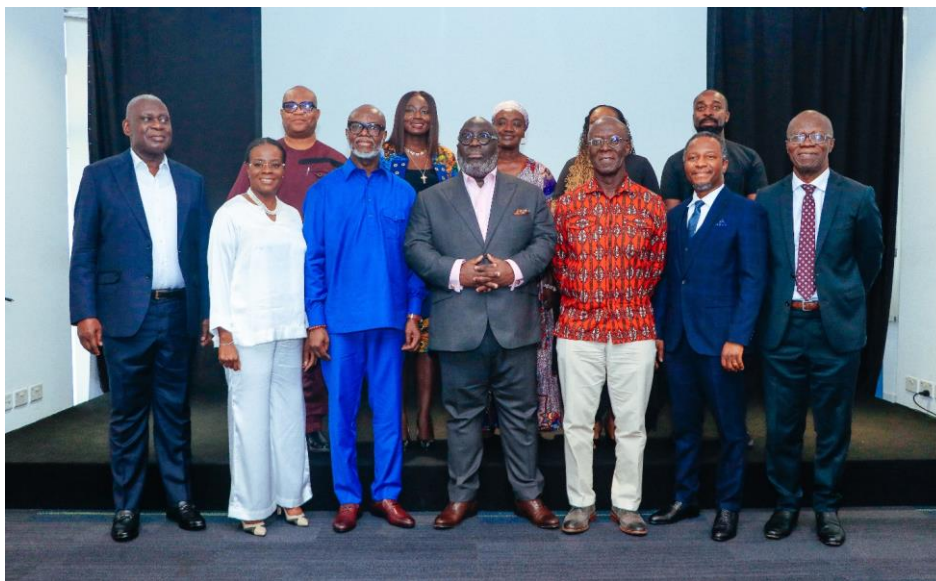
A group photograph of the Committee members with the Director General and Board Chairman of NCA

He concluded by stating that the DRC registry will be situated on the ground floor of the NCA Tower, where it will assist complainants throughout the process. Additionally, he mentioned that DRC hearings will be conducted at the NCA Tower, and in the near future, a fully functional DRC complex will be established. This complex will feature caucus rooms, real-time transcription of hearings, automated translation, and more.