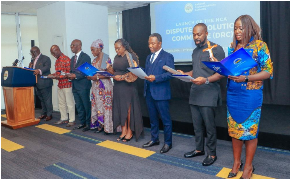
The Inauguration of the nine-member DRC committee

and will be accessible to the general public to submit disputes for the consideration of the Committee. For the first few months, there will be no filing fees for the submission of claims,” he said.