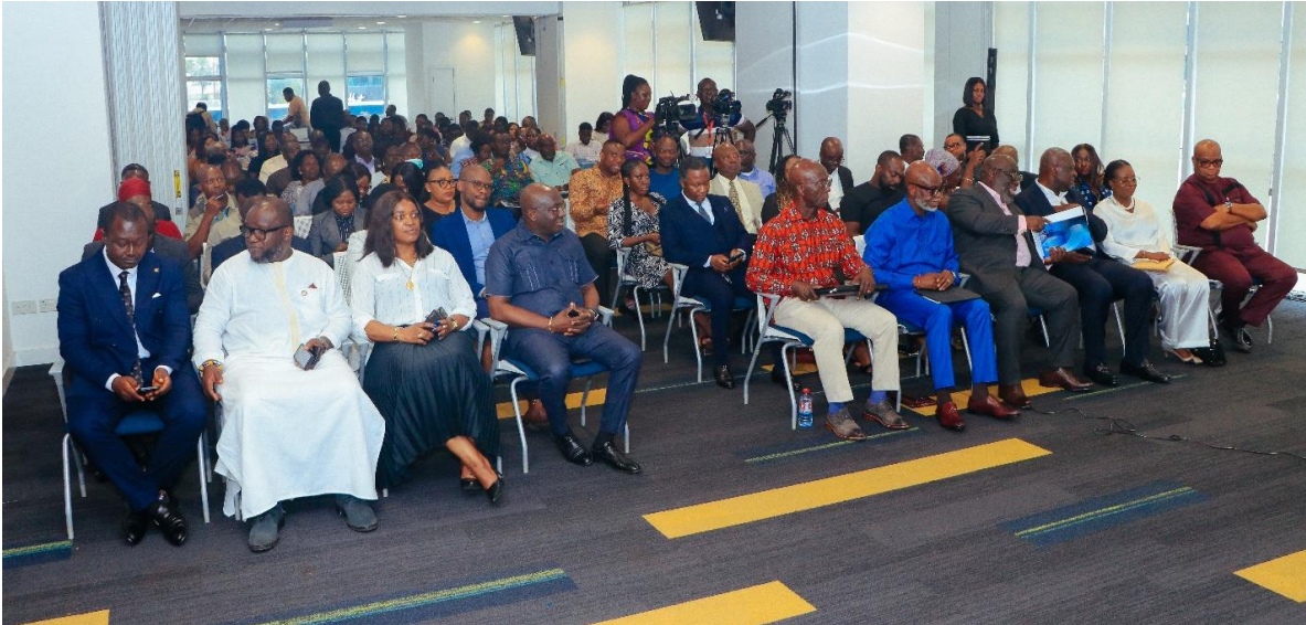
A cross section of participants at the launch