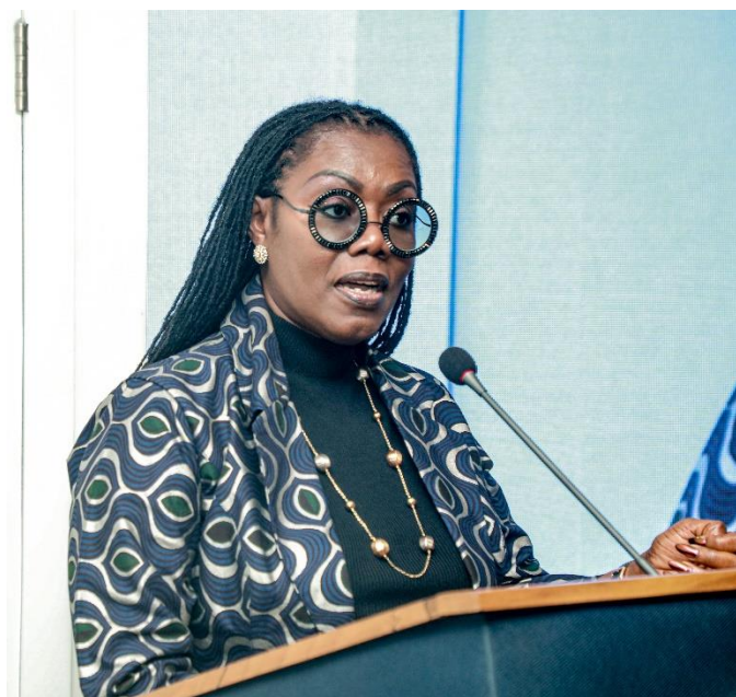
Minister for Communications and Digitalisation, Hon. Ursula Owusu-Ekuful, delivering her keynote address