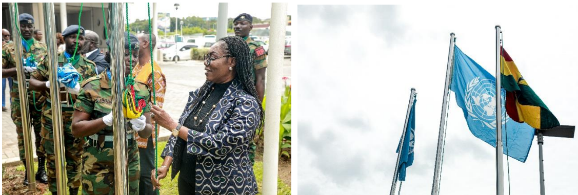
The Flag Hoisting Ceremony being done by the dignitaries with the support of the Ghana Army

As part of the event, presentations were made by three (3) local entities using digital innovation and technology to provide solutions within the Ghanaian economy. The entities were Complete Farmer Ltd, providers of farming solutions including the platform for buyers to access directly and vice versa; Glico E-Health, providers of virtual access to medical doctors and mobile laboratory and pharmacy services, and Reservoir Management Group, an organization using cutting-edge AI technology to elevate health, safety and security at the workplace.