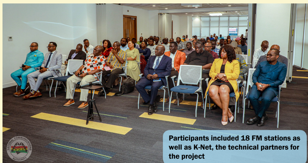
Participants included 18 FM stations as well as K-Net, the technical partners for the project