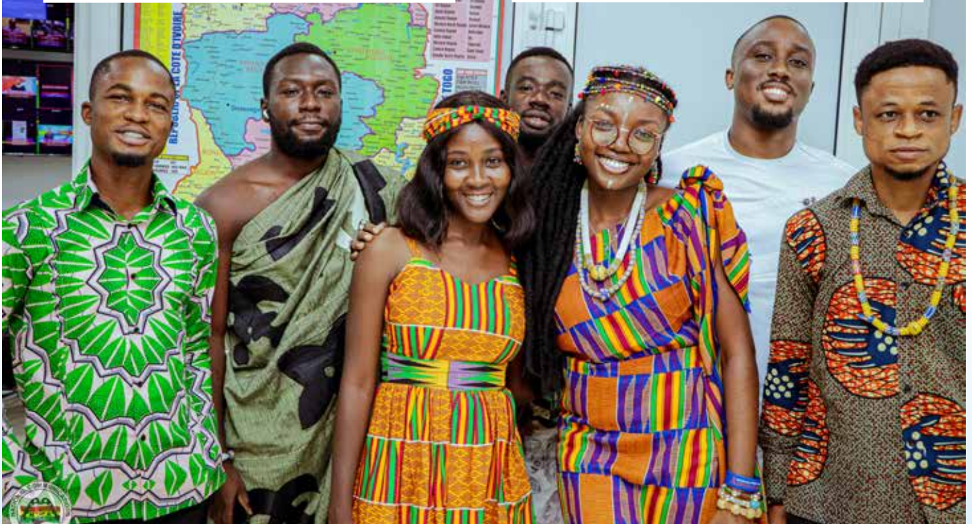
Beautiful eye-catching outfits being displayed by the Engineering Division