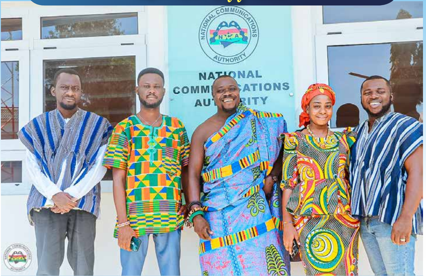
GARO showcased their Regional pride in great style