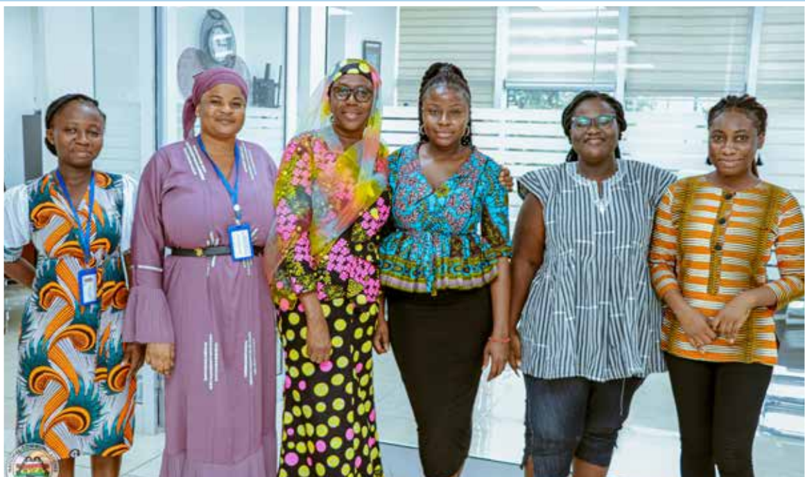
Beautiful people, Beautiful Ghanaian culture - ROD