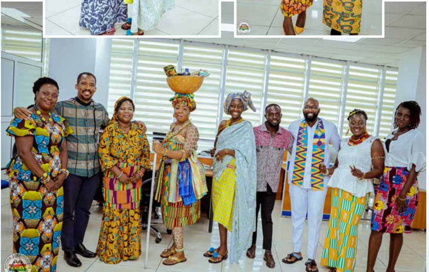
Staff from the HR Division were on fire!!