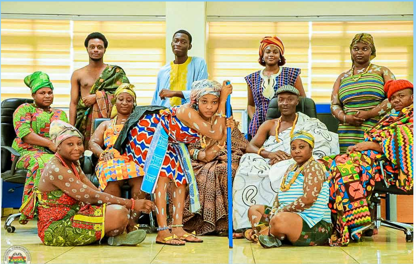
Ho Zonal Office- It was beyond representing their Region, it was pure display of rich culture and pride of Africa