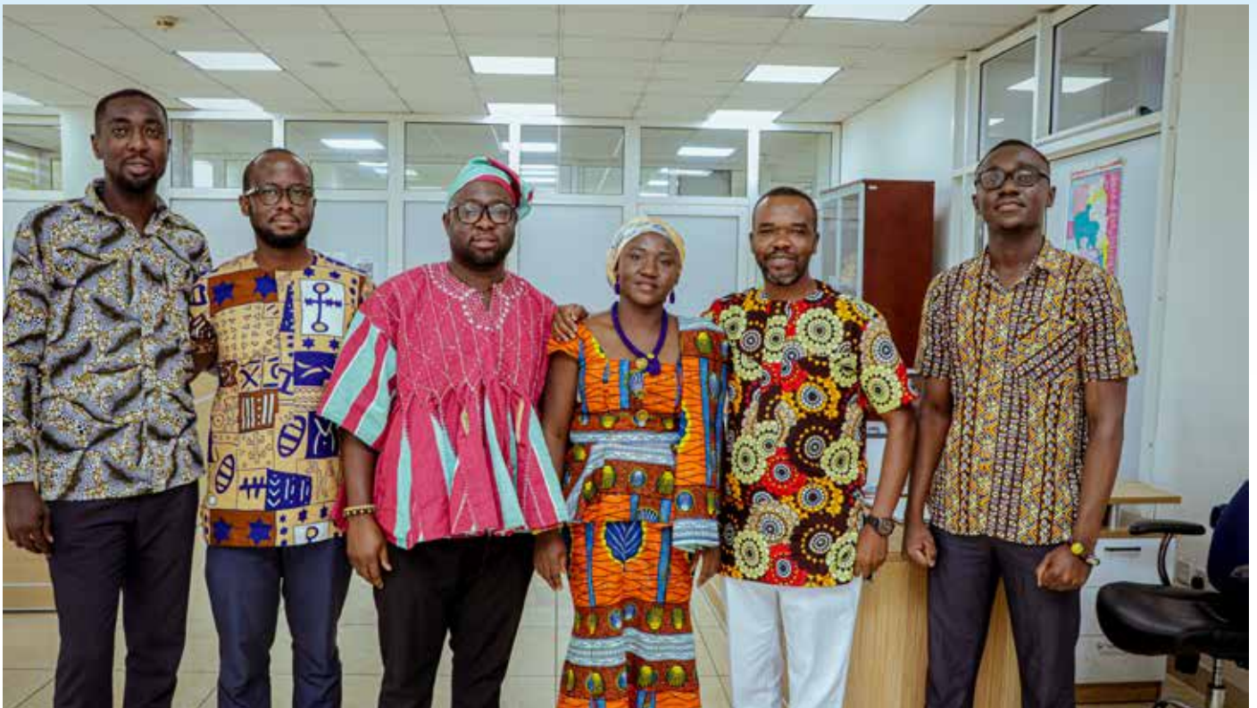
The Regulatory Division shining like the sun