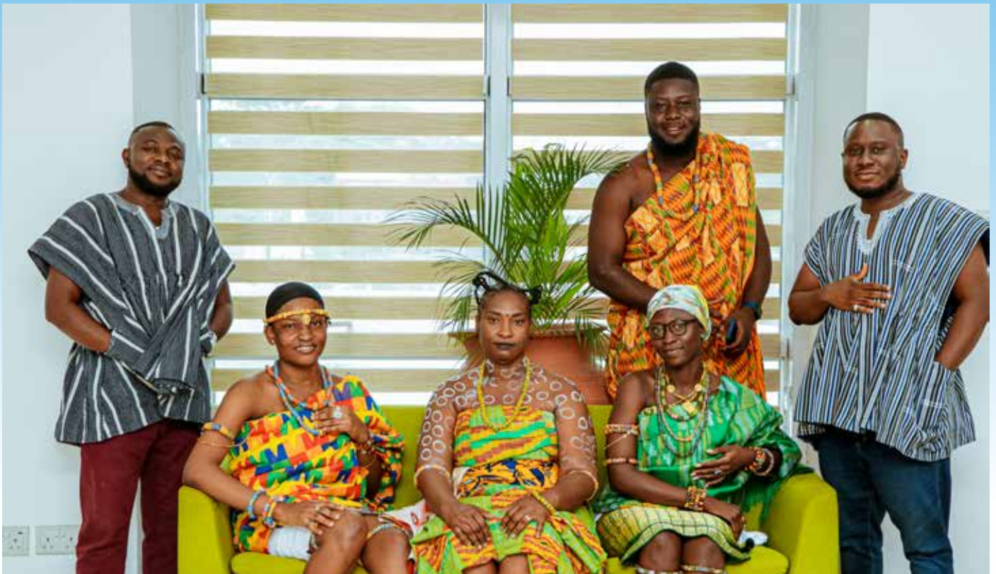
Dazzling looks from the CCAD