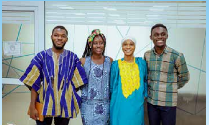
Celebrating Ghana's culture and fashion