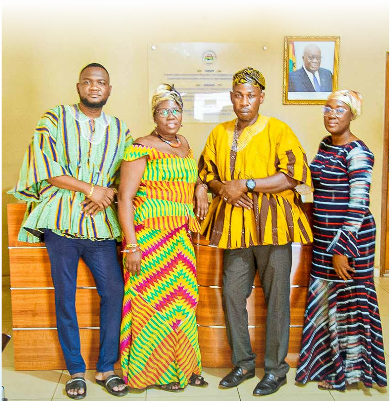
Sunyani Zonal Office - Everyone looked proud and fully represented