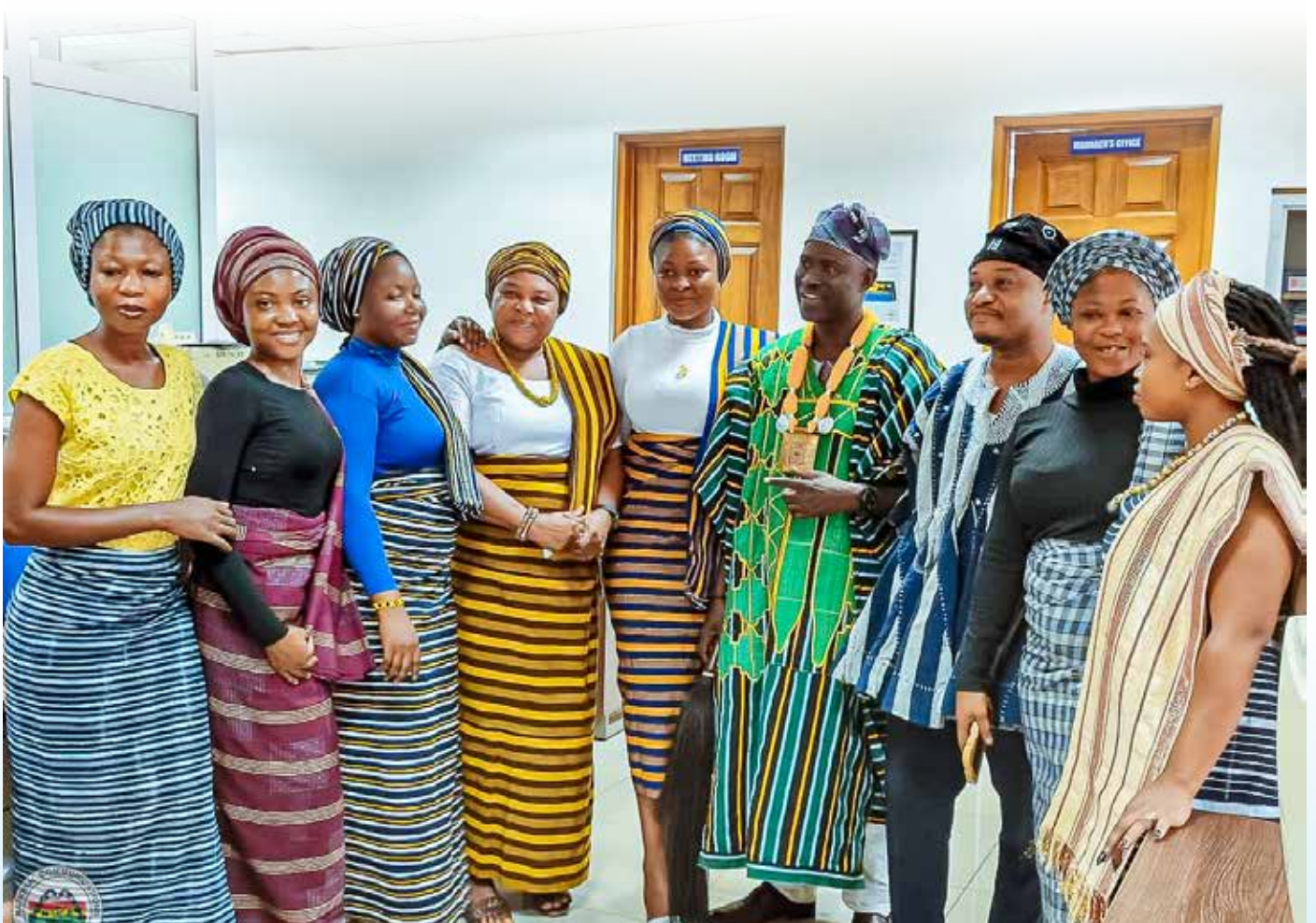
Beautiful scenes from the Tamale Zonal Office. This is a classy display of rich culture