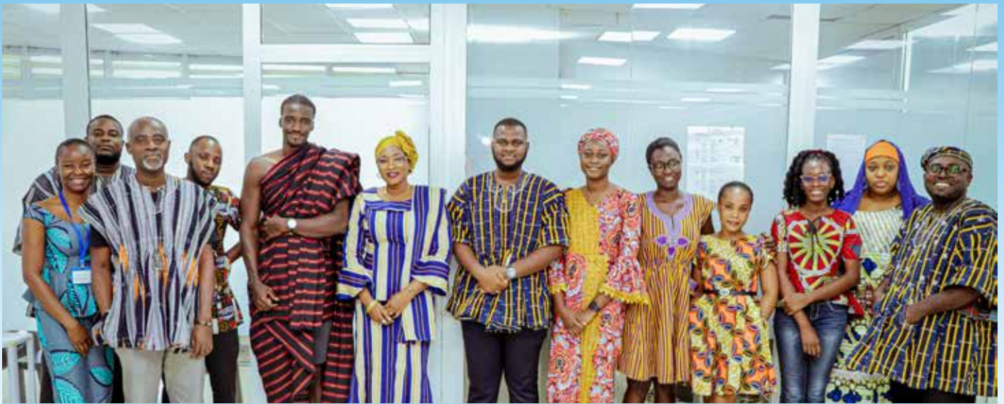
It was a true heritage month with traditional outfits from the IT Division