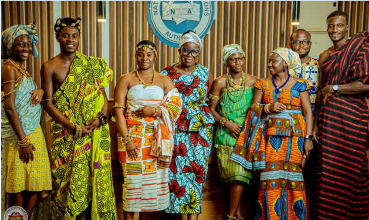
Overall Best Region – Ashanti