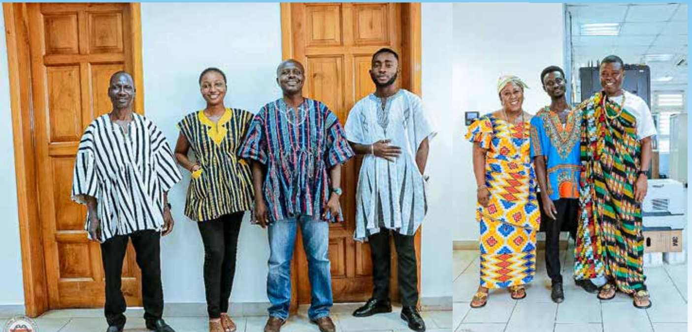
Kumasi Zonal Office - "Otumfuo Nana nom" didn't come to play.