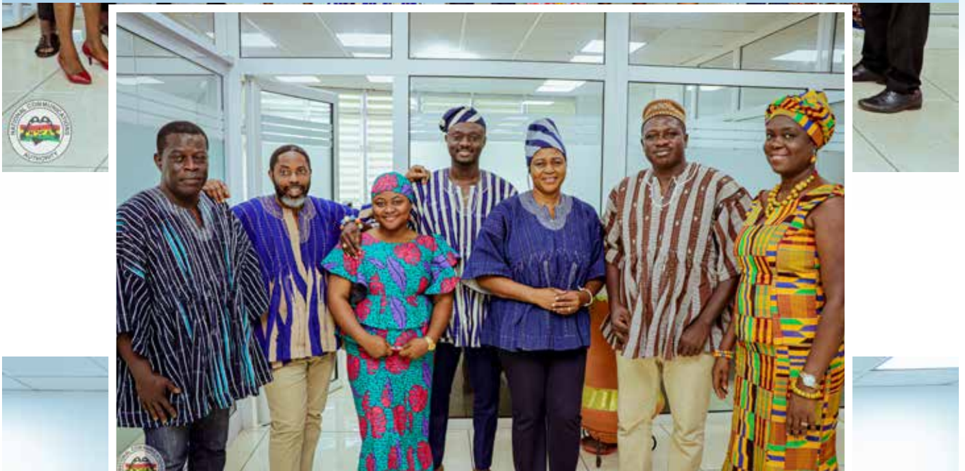
Classy and timeless - Finance Division