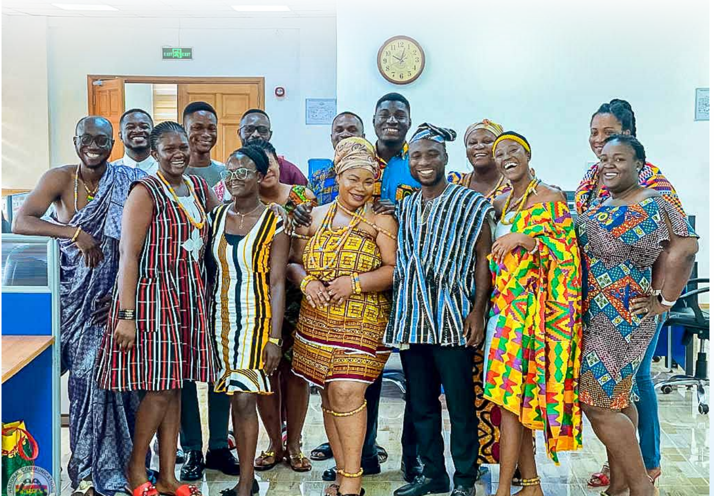
Koforidua Zonal Office – The pride of the East