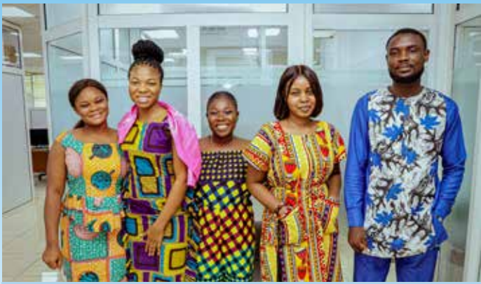
Showcase of the rich Ghanaian culture from the Procurement Division