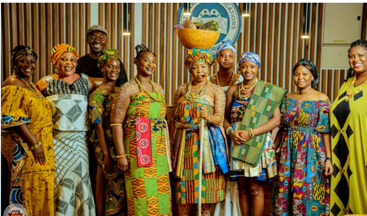
Best Performing Region – Volta